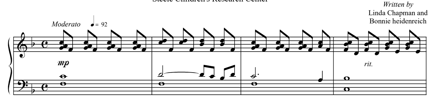
Commissioned for the Dedication of the Steele Children's Research Center