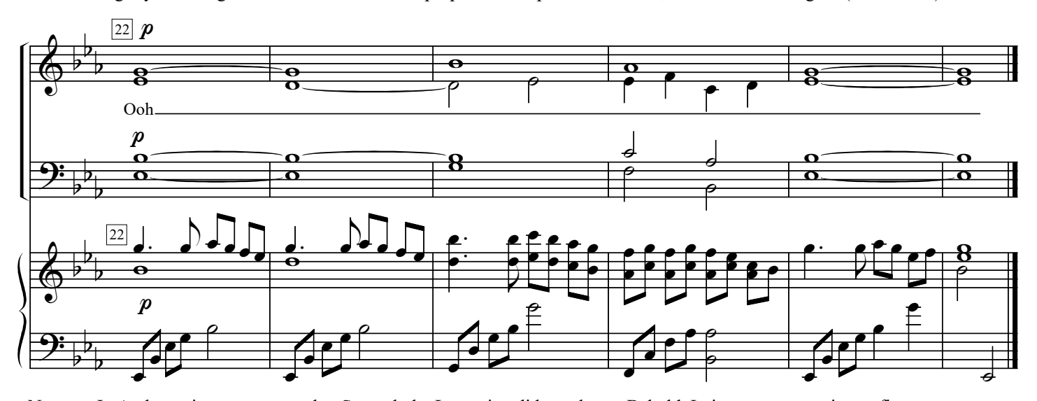
Narrator I: And now it came to pass that Samuel, the Lamanite, did prophesy...Behold, I give unto you a sign; ...five years more ...and then cometh the Son of God...And...in the night before he cometh there shall be no darkness...Therefore, there shall be one day and a night and a day, as if it were one day and there were no night...and it shall be the night before he is born. ( music begins )

...And behold, there shall be a new star arise, such an one as ye never have beheld." (Hel. 14)