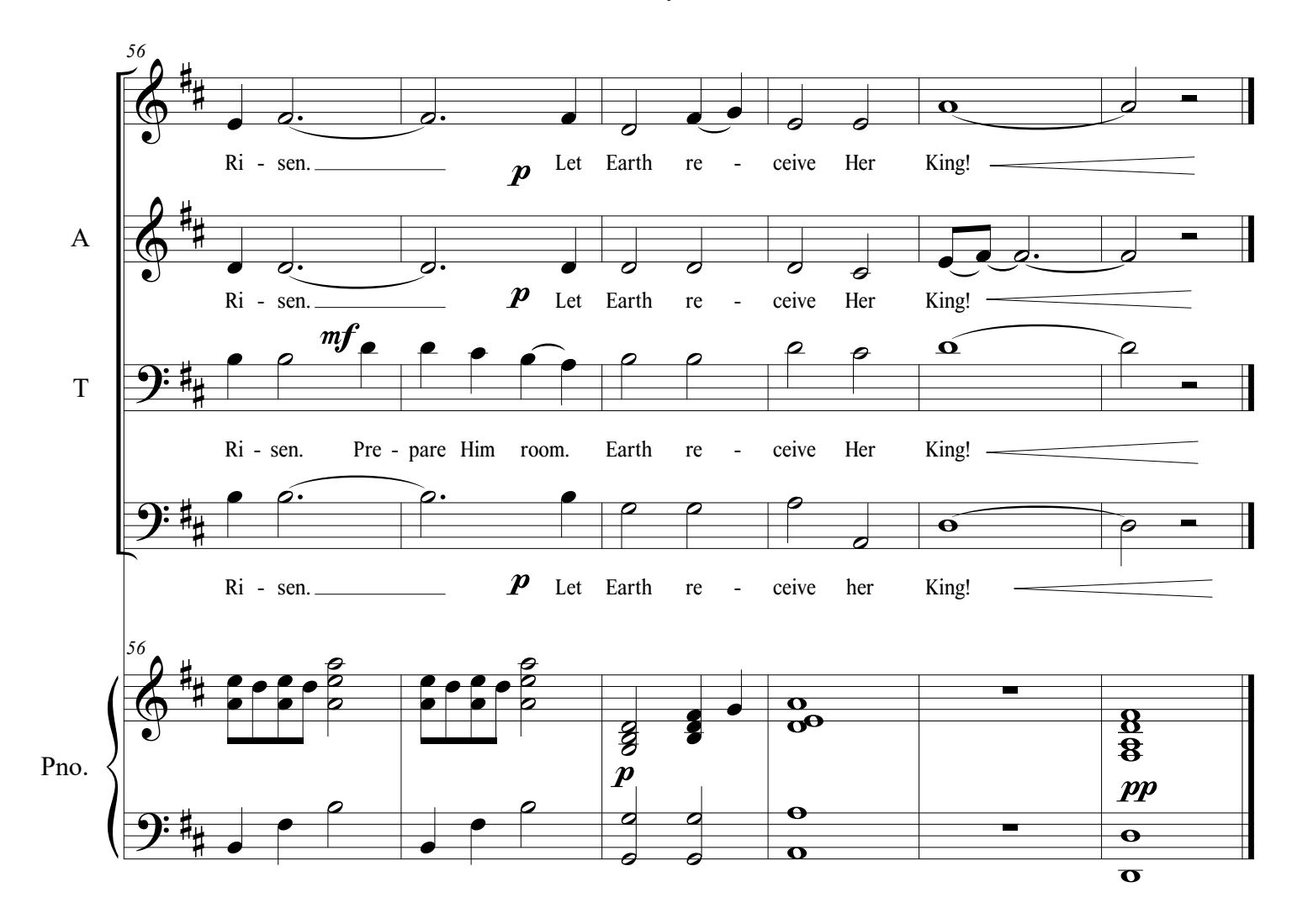
Some traditions are worth keeping.